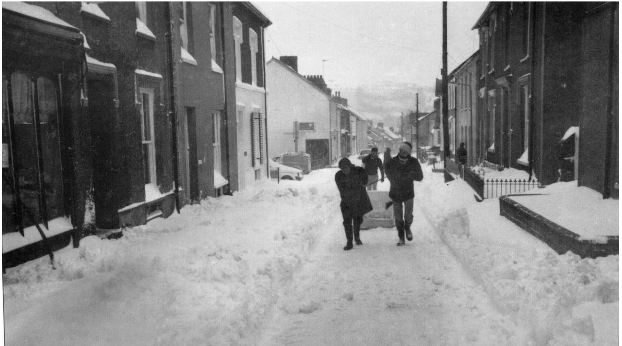
Staff Popty Fedwen yn cludo bara i Aweldeg, eira mawr Chwefror, 1982. Snow of February 1982, delivering bread to Aweldeg from Fedwen Bakery.

The Markets and Fairs Committee have issued public notices to the effect that the Christmas fair and market is to be held at Llandyssul on Tuesday, December 20th, this year.